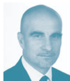
Massimo Barzagli Salvatore Ferragamo