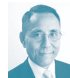
Shigeru Kikuchi Japanese Envoy