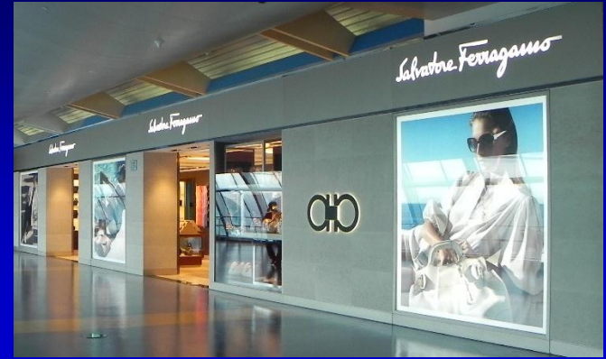
SF Store at Chongqing Domestic Terminal