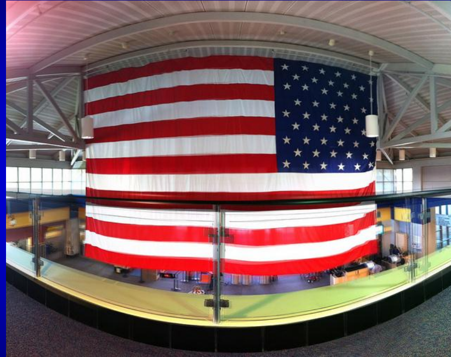
White Plains Airport, NY