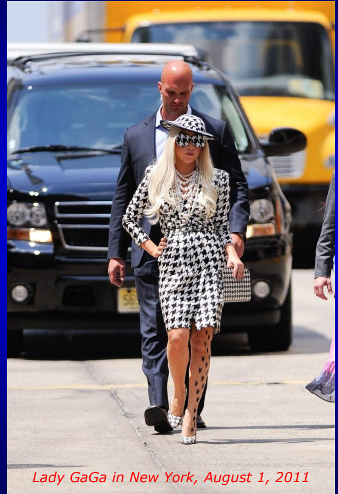
Lady GaGa in New York, August 1, 2011