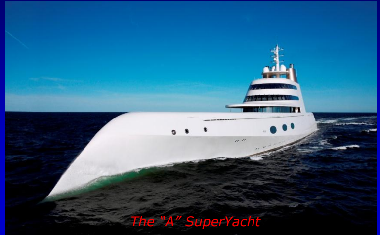
The "A" SuperYacht