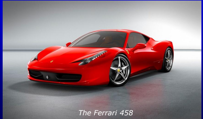
The Ferrari 458