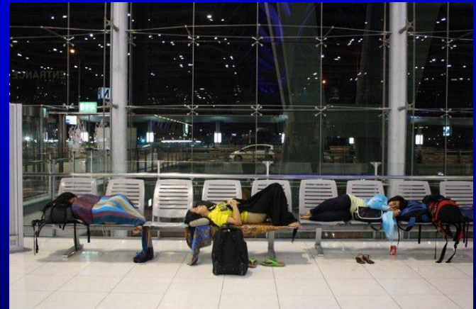
Bangkok Suvarnabhumi Airport , May 2011