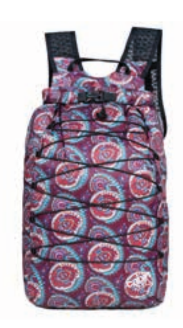
This Paisley design by CabinZero will be exclusive to global travel retail.

support, trying to unify and create dedicated content for the websites and social media channels of our retail partners to drive campaigns."