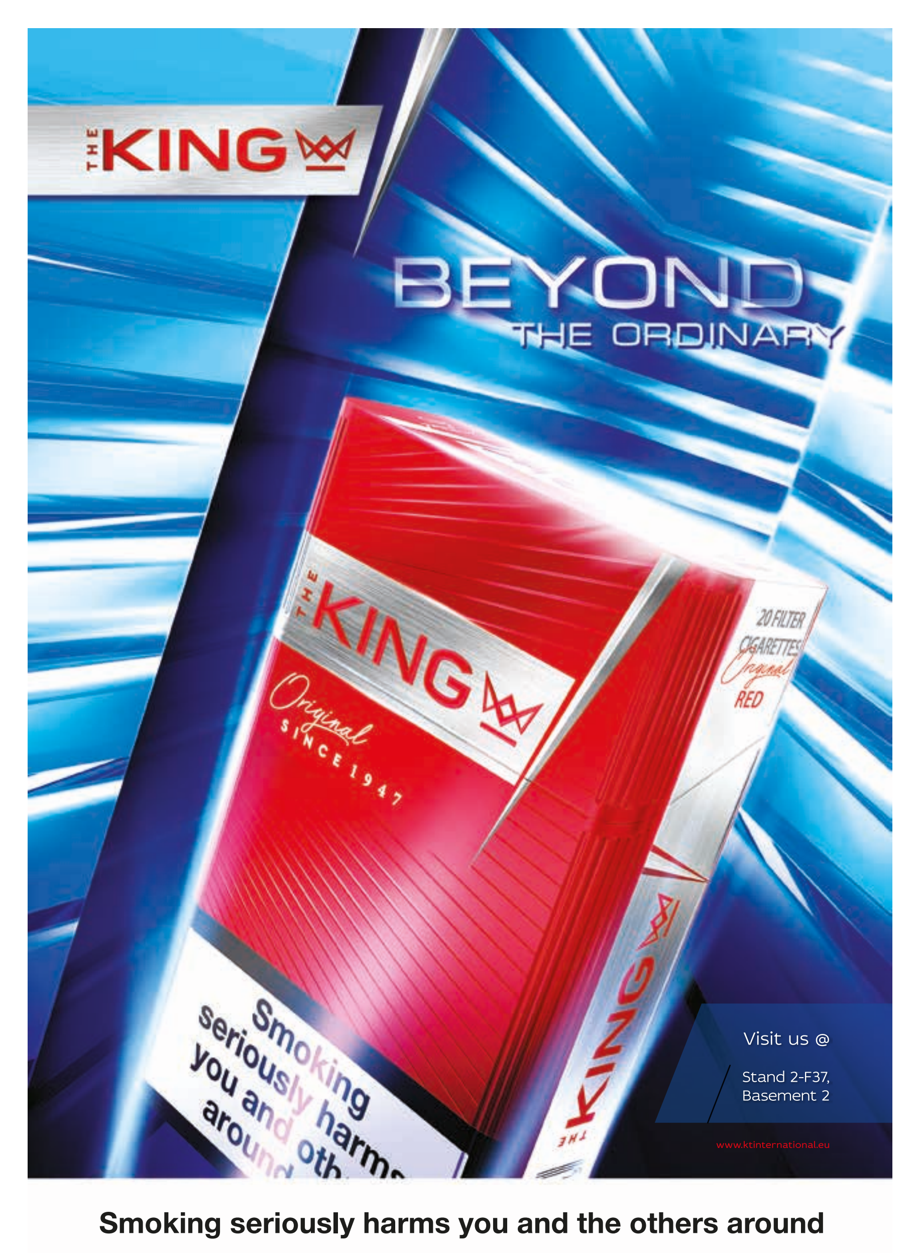
Smoking seriously harms you and the others around