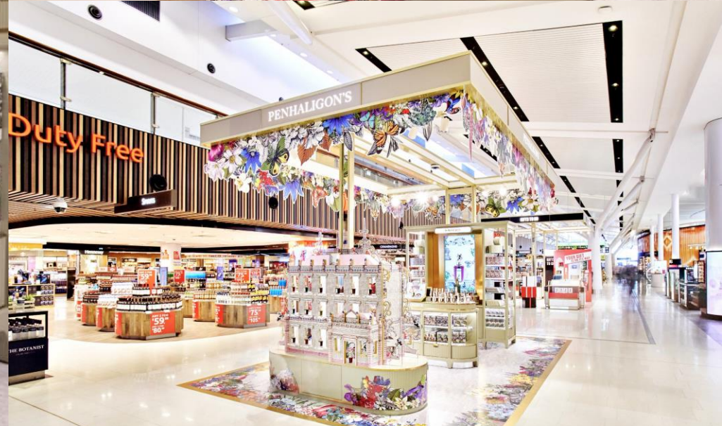
DURING ... ; PENHALIGON'S POP UP SYDNEY