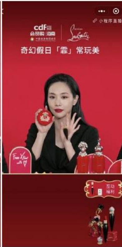
WFF Giftset Selection