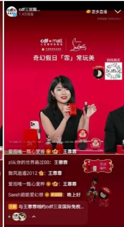
Exciting Lucky Draw

BEFORE ... | CHRISTIAN LOUBOUTIN LIVESTREAMING CDF MALL