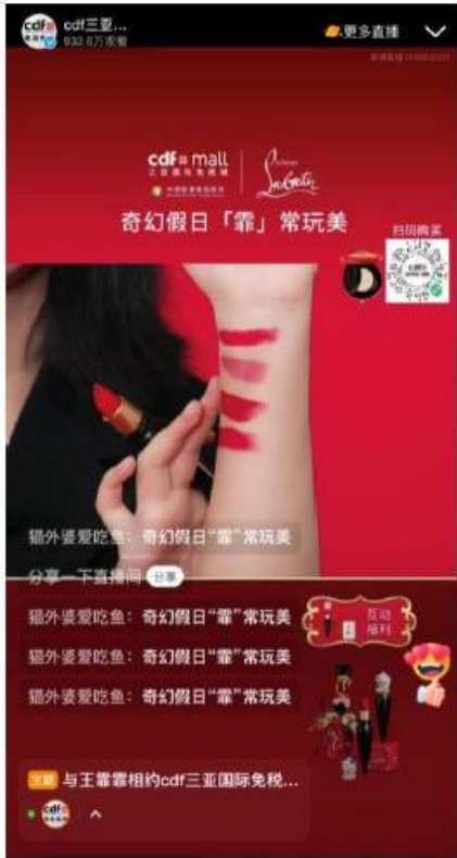
Vividly Product Trial