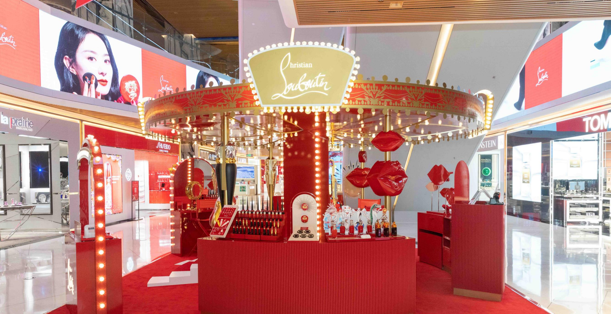
DURING ... ; CHRISTIAN LOUBOUTIN POP UP SHOP GDF