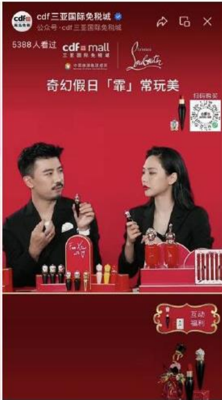
Branding Story Sharing